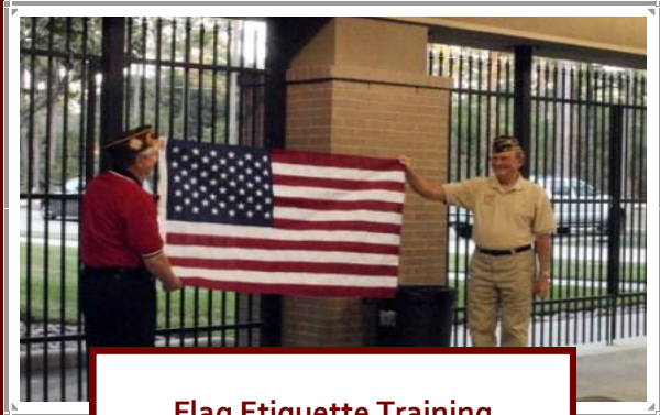
Flag Etiquette Training