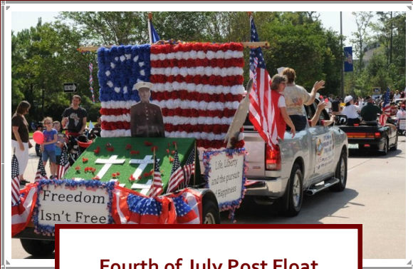
Fourth of July Post Float

The 2011/2012 VFW year is quickly slipping away. The below pictures highlight some of the accomplishments of The Woodlands VFW Post 12024 and Ladies Auxiliary activities. The Post has been very active since the opening days of this VFW year. There wasn't enough room to show all of the achievements of the Post in this magazine, but the pictures below show how active The Woodlands VFW Post 12024 and Ladies Auxiliary have been in the community.