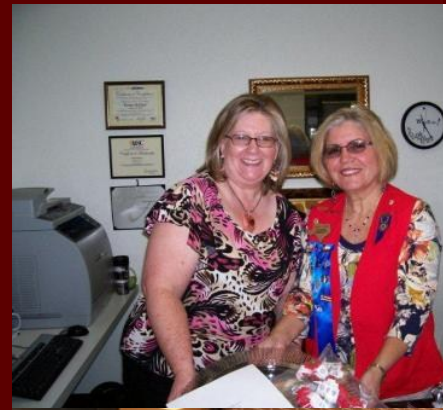
GIVING TO THE COMMUNITY