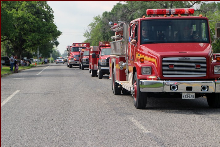
The Parade with honors coming from the Fire Department, Law Enforcement and EMT teams from the Hempstead Texas area.