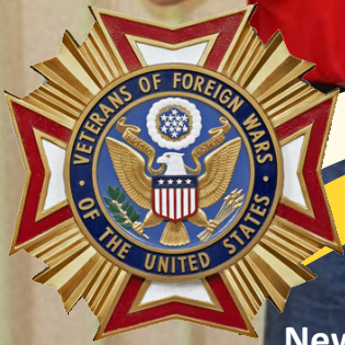
New Post Member sworn in