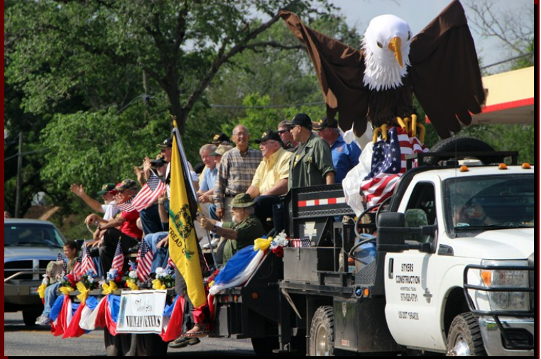
Several Vietnam Veterans participate in the Parade hosted by VFW Post 4007 in Hempstead, Texas