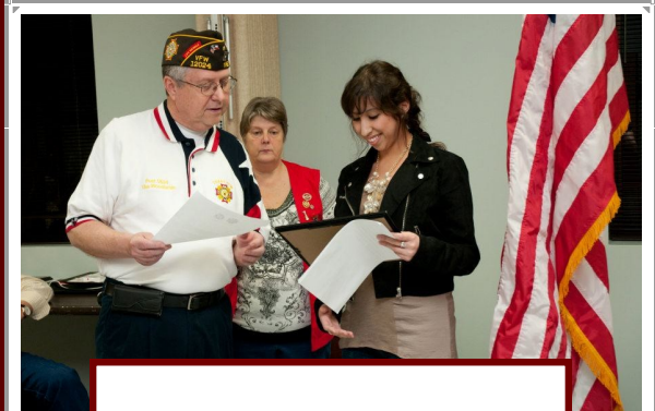
Voice of Democracy