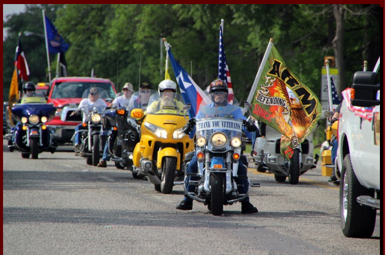
The parade keeps going on