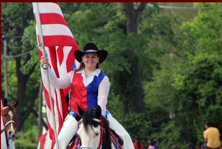
Honoring the Vietnam Veterans Texas Style