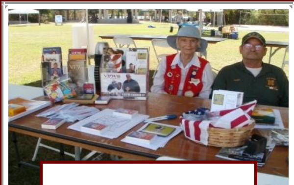
National Night Out