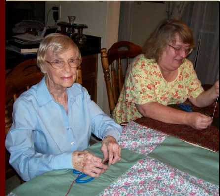
WORKING THE PROJECTS