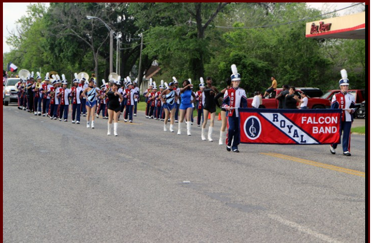
Marching Band helping the Vietnam Veterans enjoy their Homecoming in Hempstead Texas