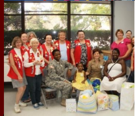
SUPPORTING THE TROOPS