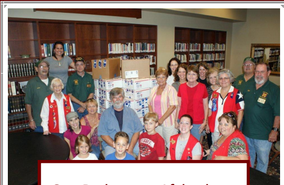
Care Packages to Afghanistan